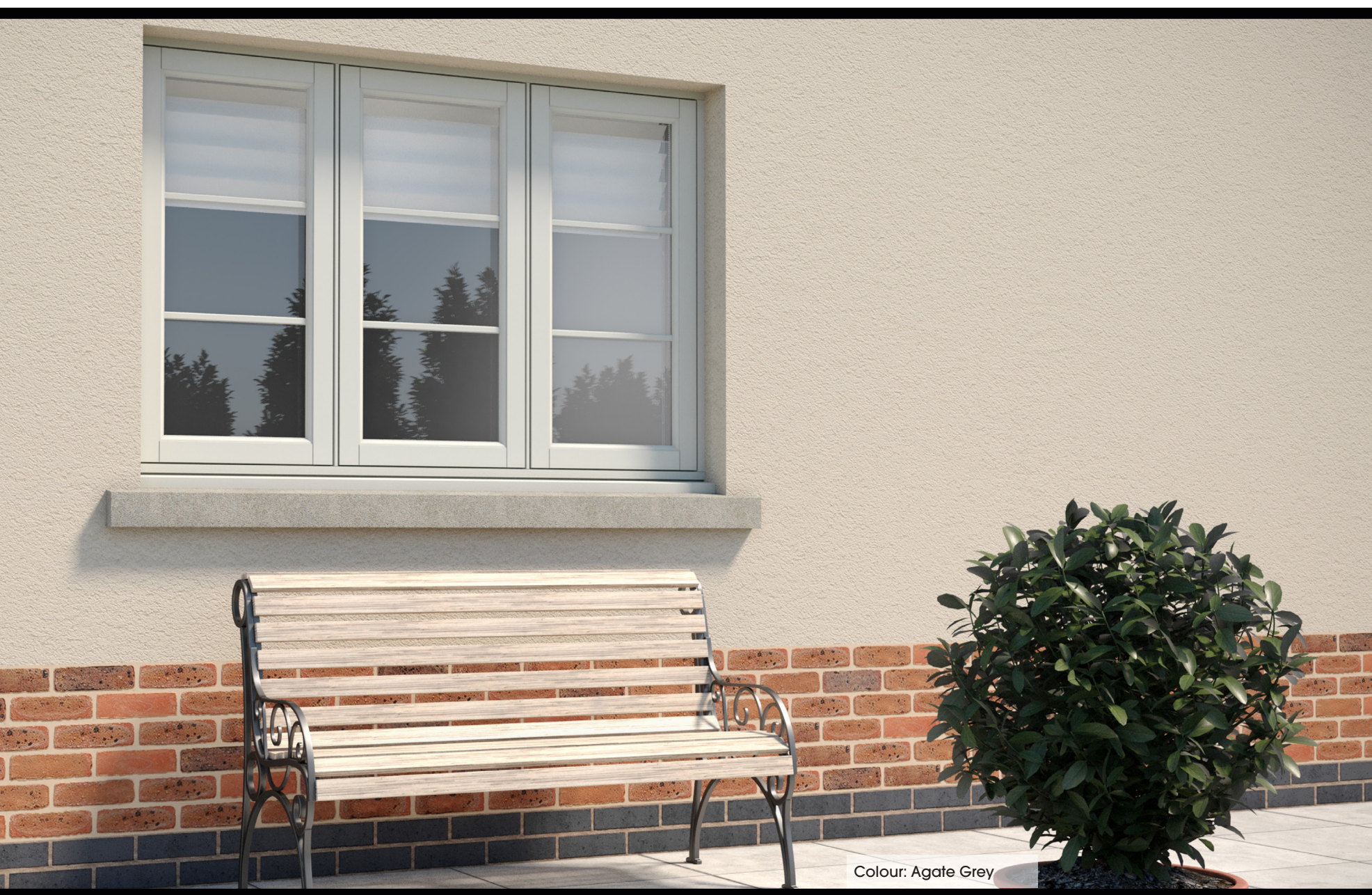
Colour: Agate Grey