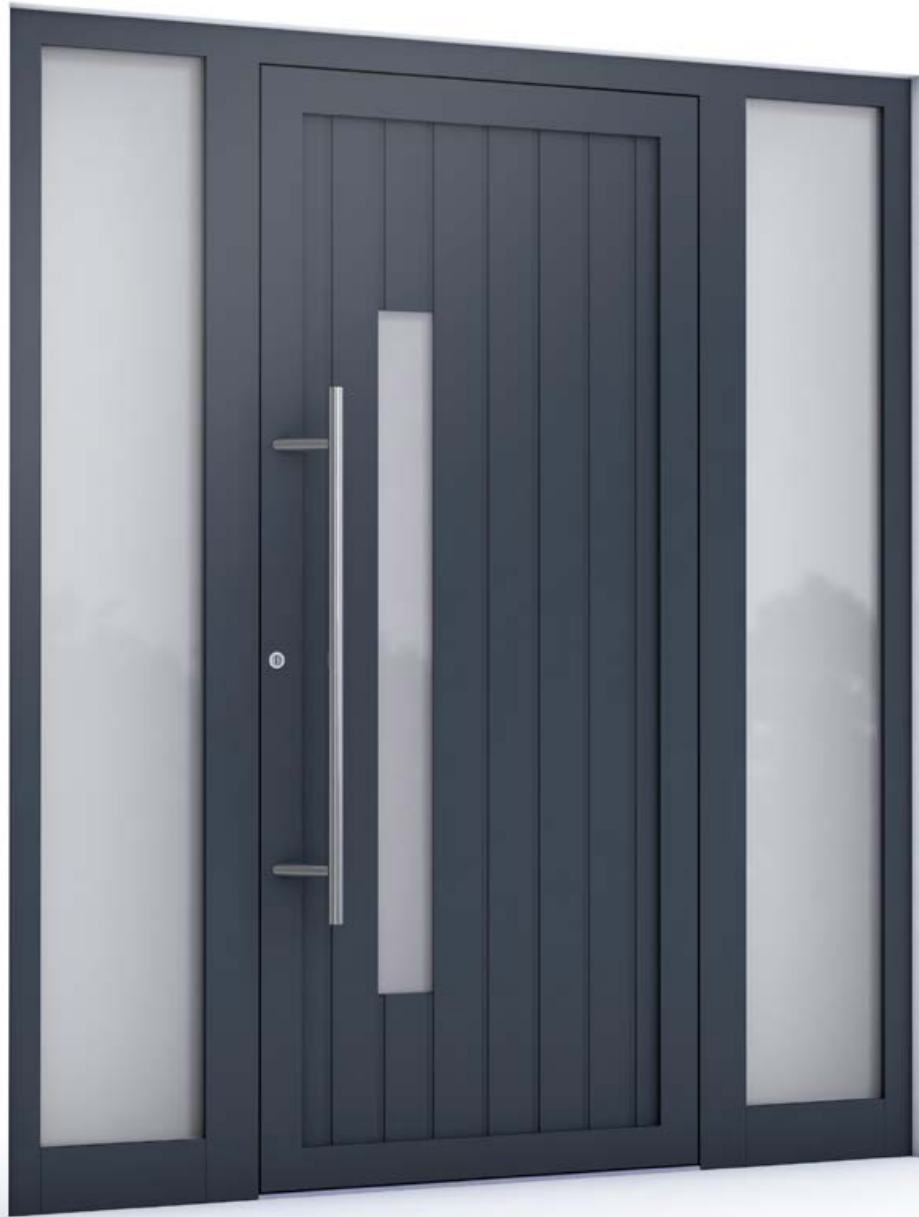
Model shown: RK 300T in RAL 7016 Anthracite Grey with optional sidelights and 1 meter long bar handle.