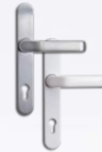
ES 2641 SAA silver or white internal lever handle with spring return