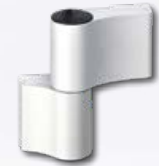
ES 2420 2 piece flag hinge in SAA Silver or White