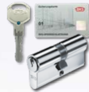
ES 2217 BKS Livius security cylinder with registration card